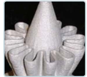
Exhaust Duct Fabricated by LENS System