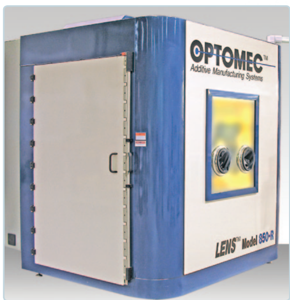
LENS 850-R System

LENS 850-R is a state-of-the-art Additive Manufacturing system, using advanced alloys to restore the functionality of high value metal components.