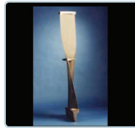
Compressor Blade Repaired by LENS System