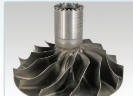
Impeller repaired by LENS 850-R System

The LENS 850-R system offers a large 900 x 1500 x 900mm working volume, making it ideal for repair, rework and modification of large industrial components. The LENS 850-R uses a high-power IPG Fiber Laser to build up structures one layer at a time directly from metal powder. The resulting material has mechanical properties that can be equivalent to or superior than the original component. The 850-R offers a full range of features, including 5-axis CNC-controlled motion, closed-loop controls, and full atmosphere control. These features, backed by Optomec's full application and service support, make the 850-R the system of choice for industrial additive manufacturing users.